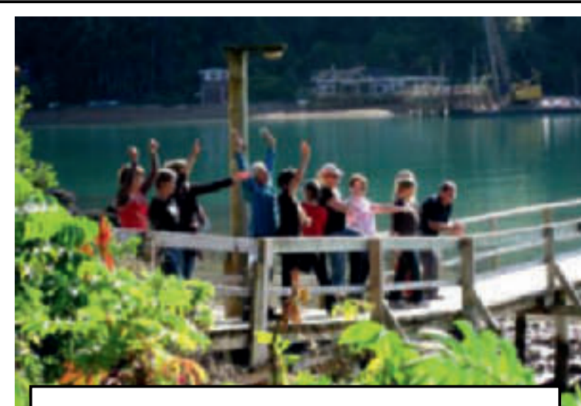
Island singing retreats.